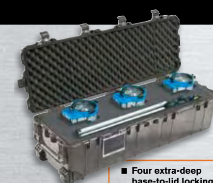
■ Four extra-deep base-to-lid locking cleats that ensure maximum stacking stability