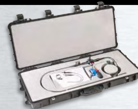
> Shown with custom foam solution designed for a medical endoscope.